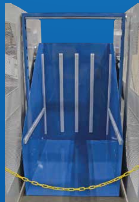
Carriage wear pads