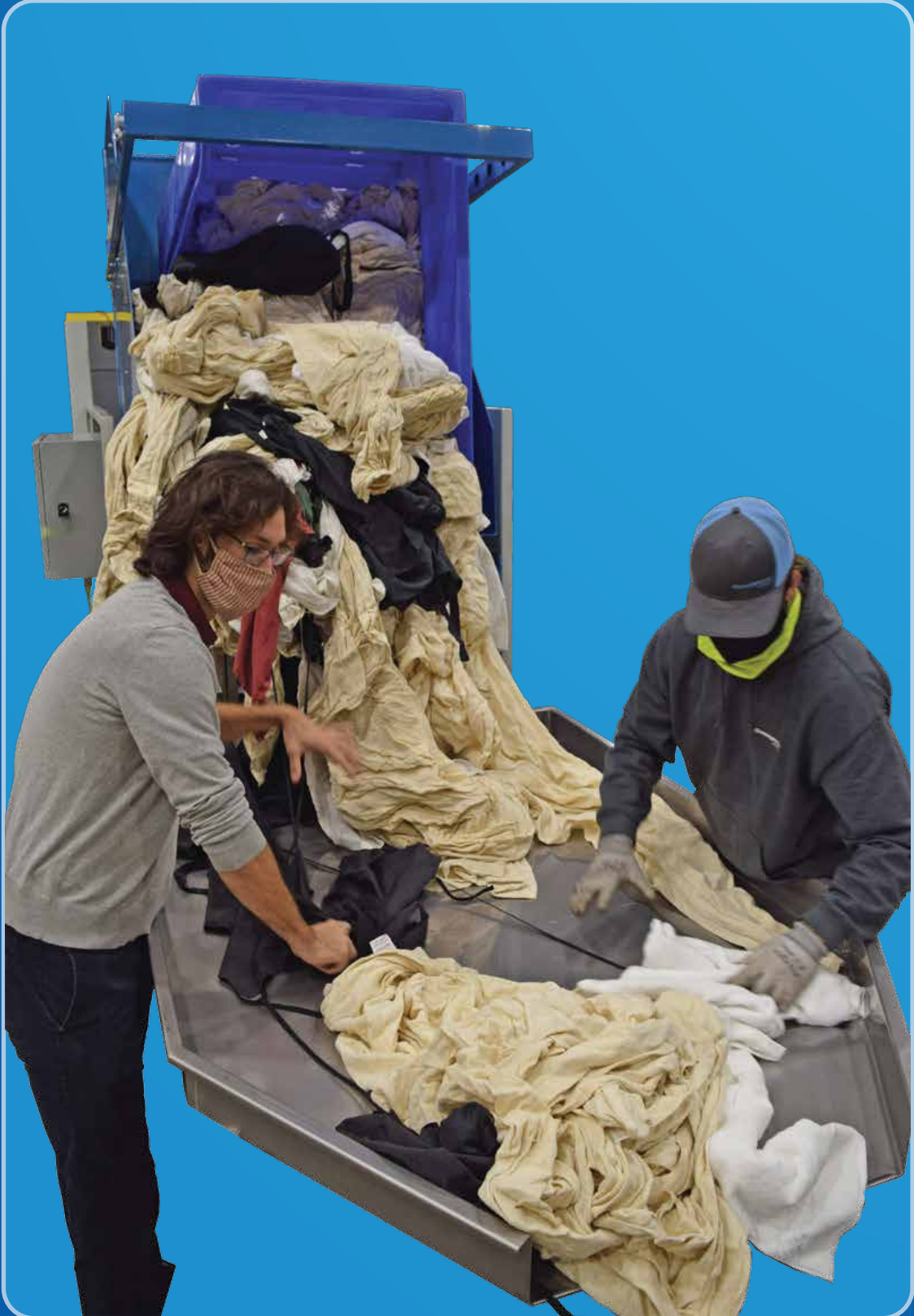
Prevent work-related injuries by eliminating all the heavy lifting and also improve operational efficiencies.

Economical and safety-conscious solutions that are low maintenance, quiet and clean to exactly fit your soil sorting areas demands.