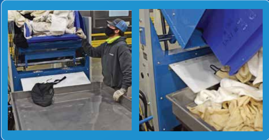
Plastic deflector bridges the gap between the cart dumper and the breakup table